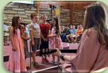
Kumbaya | Rainbow Choir