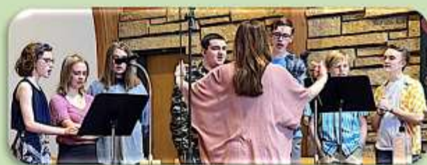
And We Sing Gloria | Youth Choir