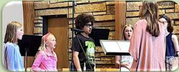
Sing to the Lord a New Song | Sonshine Choir