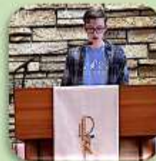
Scripture, Luke 24:36b-48 (CEB) Owen Shatters