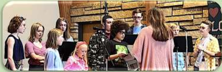
Alleluia, He Is Risen! | Sonshine & Youth Choirs