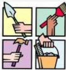
God's Work Our Hands