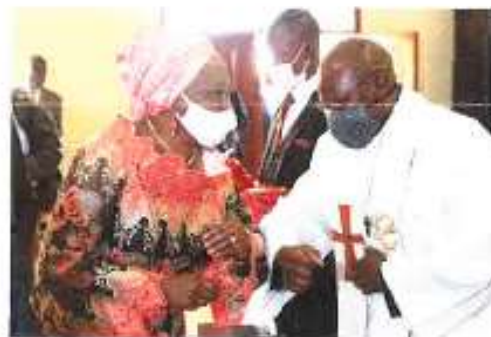
Two members greet one another at church service of the United Church of Zambia