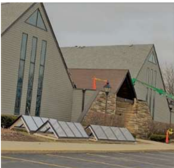
Three skylights ready to be installed