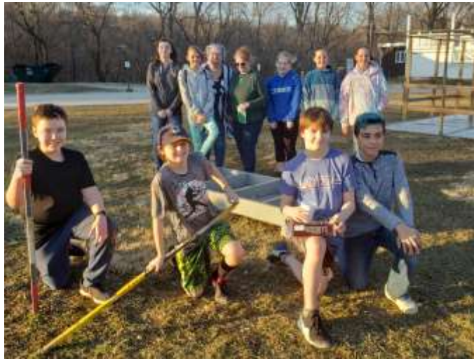
Alpha students who attended the Dickson Valley Youth Event on Sunday March 8, 2020.