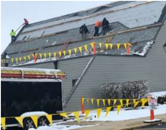
South slope of Fellowship Hall