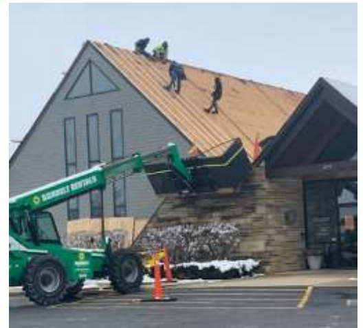
North slope of Fellowship Hall