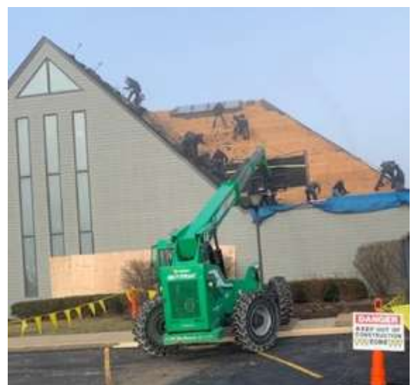
North slope of Sanctuary