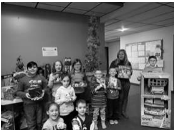
Children helping children!